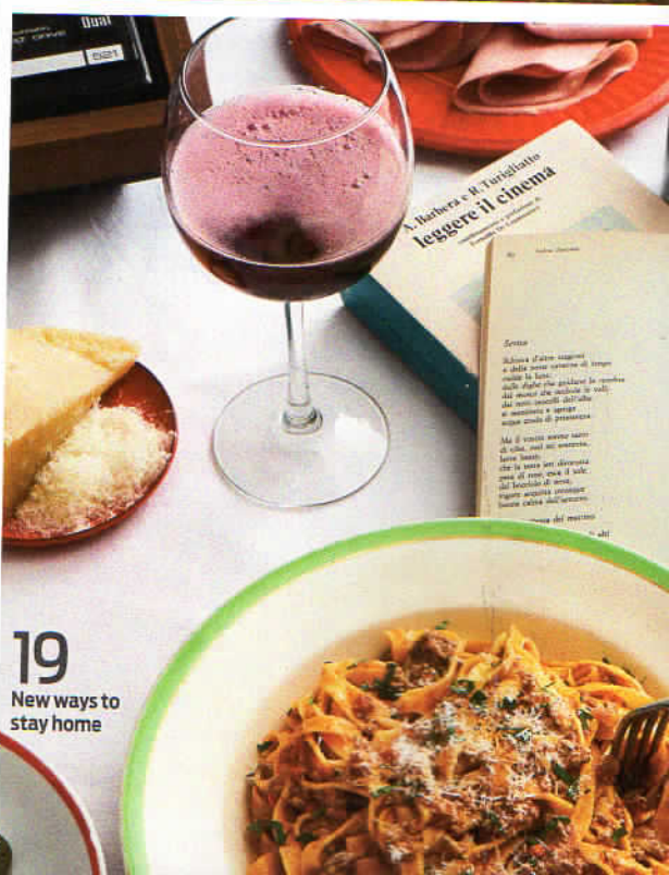
19 New ways to stay home